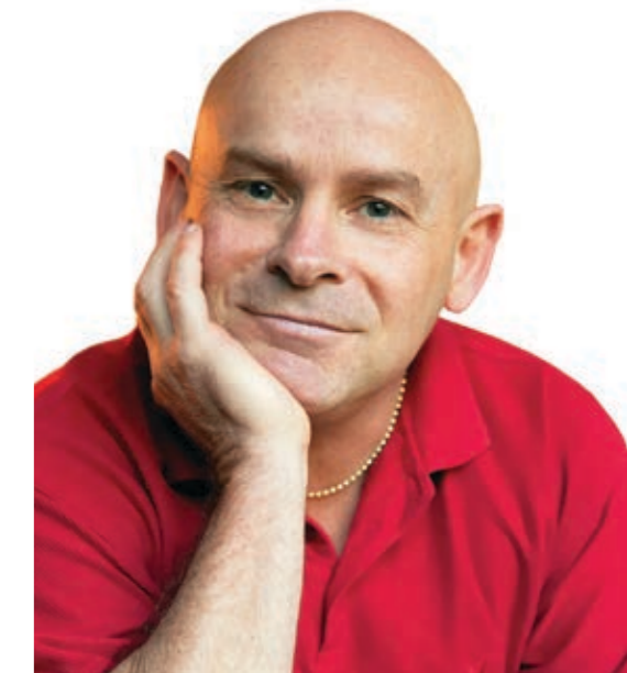
By Glenn Cardwell Accredited Practising Dietitian

If people would just stop jumping on any food trend that passes through their television screen and took time to listen