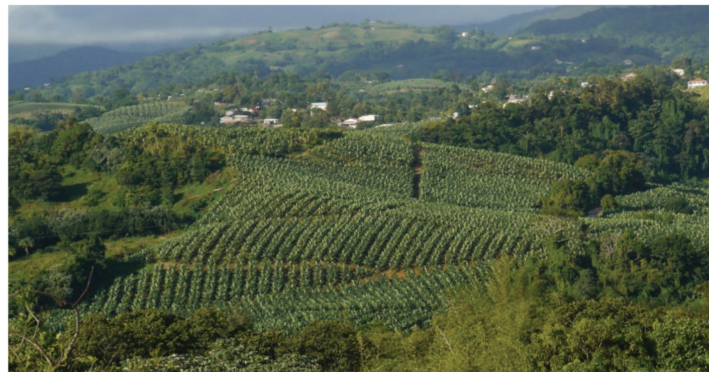
Below: Banana farms in the French West Indies have cut chemical use.