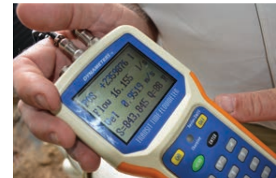
An Electrical and Conductivity (EC) and salinity meter checks the amount of nutrient passing through the fertigation system.

Having the transducer correctly positioned will help give more accurate