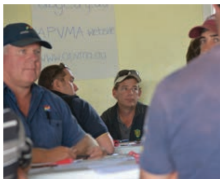
Banana growers at the roadshow held for Tablelands growers at Walkamin in north Queensland.

Presenters with years of research and technical experience were given only a strictly-policed, ten-minute timeslot to tell banana growers and industry partners the key points about their projects.