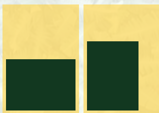
1/2 page wide (3 cols) 186mm (w) x 128mm (h) 1/2 page tall (2 cols) 128mm (w) x 190mm (h)