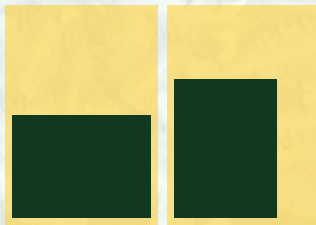
1/2 page wide (3 cols) 186mm (w) x 128mm (h) 1/2 page tall (2 cols) 128mm (w) x 190mm (h)