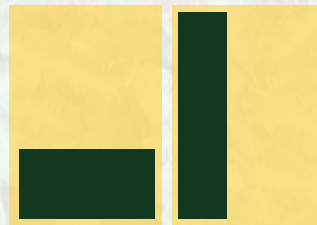
1/3 page wide (3 cols) 186mm (w) x 85mm (h) 1/3 page tall (1 cols) 60mm (w) x 257mm (h)