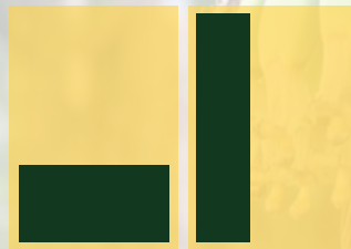
1/3 page wide (3 cols) 186mm (w) x 85mm (h) 1/3 page tall (1 cols) 60mm (w) x 257mm (h)