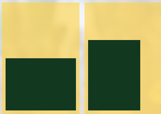
1/2 page wide (3 cols) 186mm (w) x 128mm (h) 1/2 page tall (2 cols) 128mm (w) x 190mm (h)